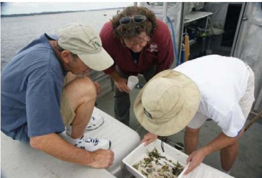
Scientists from SJRWMD look over a sample of mussels from the river as part of their study of water quality.

The Lower St. Johns River Basin (LSJRB) has a total area of 1,763,172 acres and includes all or part of Clay, Duval, Flagler, Putnam, St. Johns, and Volusia counties. The estuarine portion of the St. Johns River flows north from Welaka to the river's mouth at Mayport. This stretch of the river is tidally influenced and is an important breeding and feeding area for a variety of fish and wildlife. The lower St. Johns River is a designated priority water body of the 1987 Surface Water Improvement and Management (SWIM) Act.