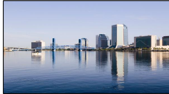
The Jacksonville riverfront