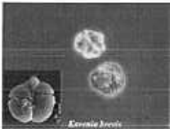
Mote Marine Laboratory

A red tide is a naturally occurring algal bloom that occurs around the world. Karenia brevis is the red tide species indigenous to the Florida coast. Blooms begin offshore in deep waters but the process is not well understood. The bloom moves upward in the water column, then after reaching the surface, moves toward shore in a direction and speed dictated by prevailing winds and currents.